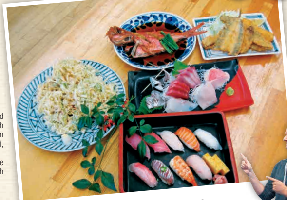
K7-4 Banyia dining

The fish caught in fixed nets offshore each morning, can be eaten as, for example, sushi, sashimi or tempura. Get a real feel for the deliciousness of fresh fish.