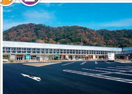
K7-3 Road Station Hota Elementary School

An integrated facility using a disused elementary school. Includes shops and restaurants selling regional products.