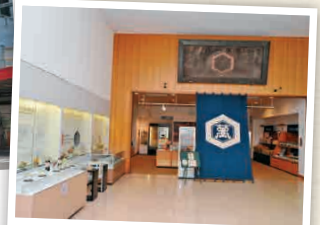
T2-1 Kikkoman Soy Sauce Museum

〒110 Noda, Noda (In the Noda plant of Kikkoman Corporation) ☎04-7123-5136 ☒9:00-16:00 (Final admission 15:30) ☒Every 4th Mon. ☒Free ☒Available