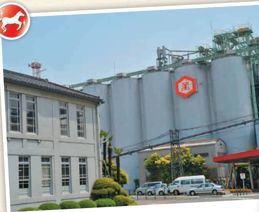
T2-1 Kikkoman Soy Sauce Museum

A museum of a leading manufacturer of soy sauce in Japan. Learn more about the soy sauce making process. Tastings possible.