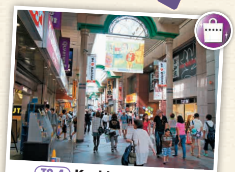
T2-4 Kashiwa-Nibangai covered shopping arcade

〒805 Niishi-Fukai, Nagareyama ☎04-7152-1008 ☒11:30-16:00, 17:00-22:00 ☒Mon. (open if public holiday) ☒Available