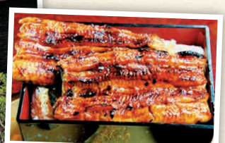
T2-3 Shinkawa Japanese restaurant