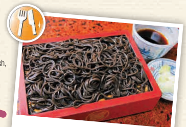
H3-6 Koboriya Honten

☎ 460 Sawara, Katori ☎ 0120-52-3571 ☎ 8:00-19:00 ☎ Open year-round ☎ Available