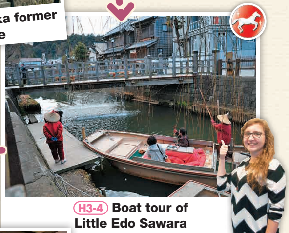
H3-4 Boat tour of Little Edo Sawara

☎ 1900-1 Sawara, Katori ☎ 0478-54-1118 ☎ 9:00-16:30 ☎ Open year-round ☎ Free