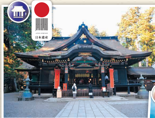
H3-1 Katori-jingu Shrine

As there are around 5kms between Sawara Station and Katori-jingu Shrine, use of a taxi is recommended. The Sawara loop bus operates on Sat., Sun., and public holidays. 300 yen or one-day boarding pass 500 yen. One to two buses per hour. It is possible to cover Sawara on foot.