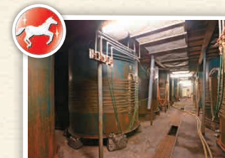
H3-7 Tokun Sake Brewery

☎ Sawara 1505, Katori ☎ 0478-52-4128 ☎ 11:00-16:00 ☎ Wed. (variations by season) ☎ Available