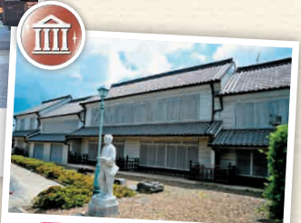
H3-2 Ino Tadataka Museum

☎ 1679 Katori, Katori ☎ 0478-57-3211 ☎ 8:30-17:00 ☎ Open year-round ☎ Free ☎ Available